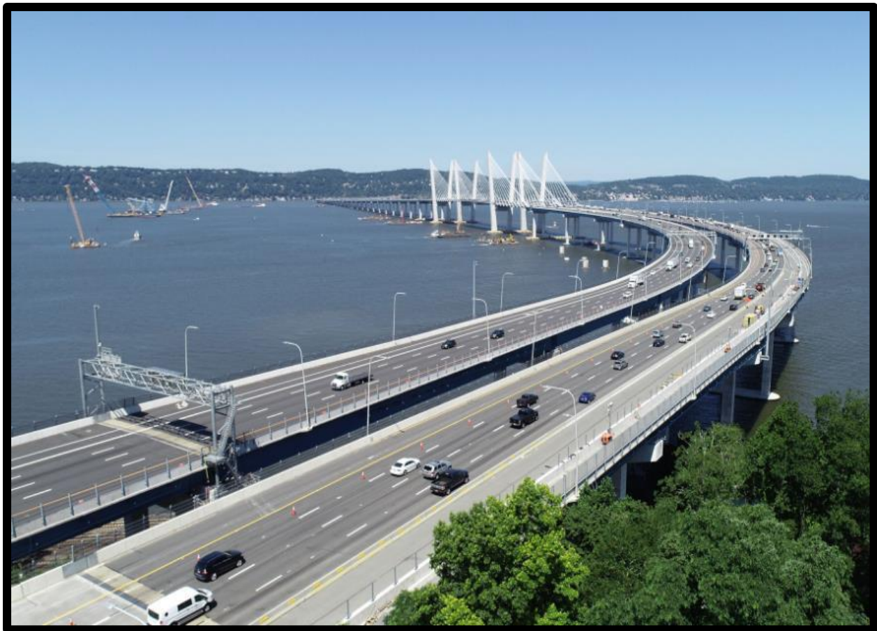
Governor Mario M. Cuomo Bridge viewed from the Westchester County shoreline. Winner of the 2020 Project of the Year Award, over $75 million.

An electronic publication of the New York Metropolitan Chapter of the American Public Works Association