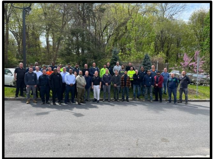
Group Photo including attendees, speakers and Westchester County Association of Municipal Public Works Administrators staff.